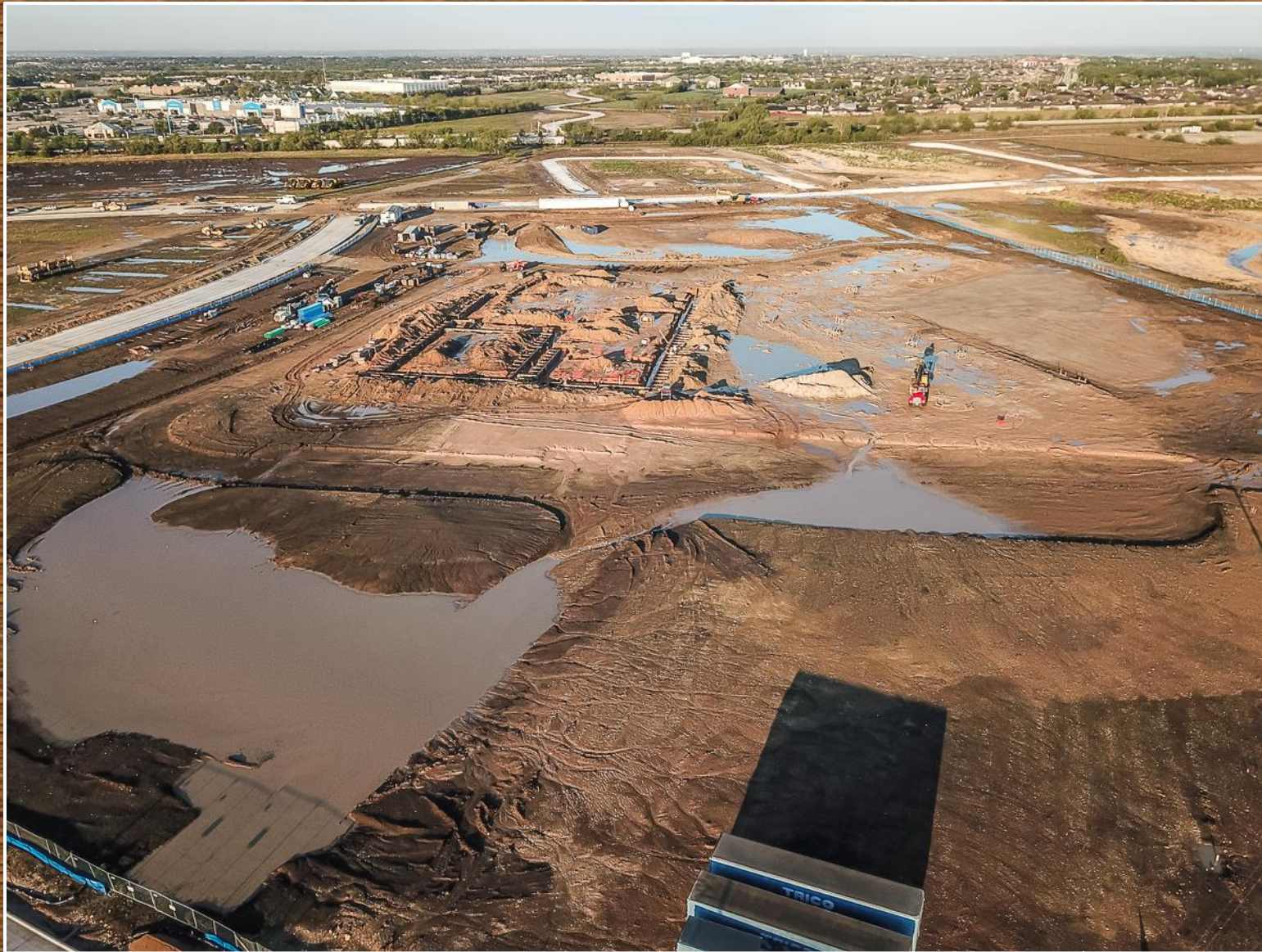
Overview of the site showing the main gymnasium and cafeteria areas.