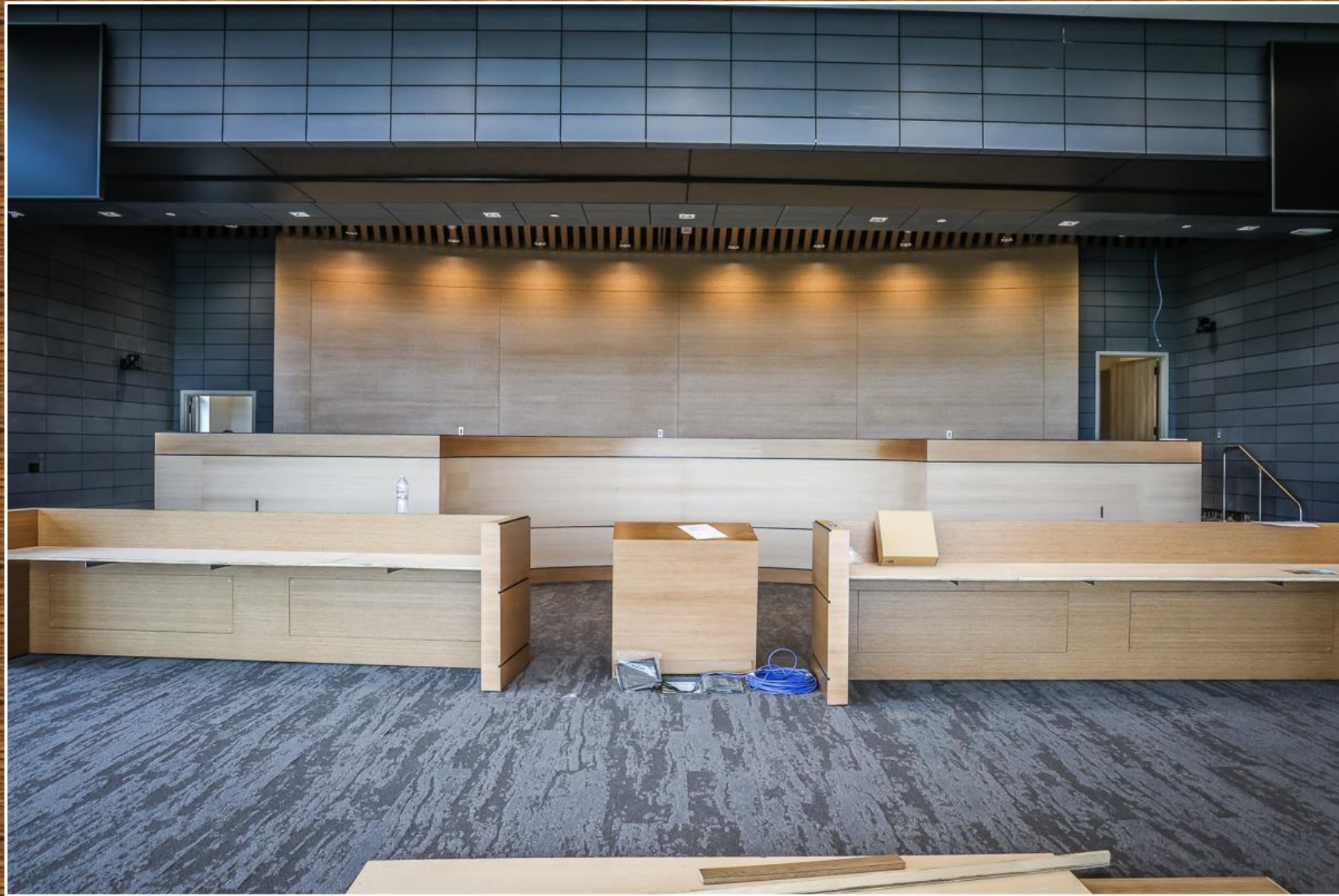
Installation of mill work and finish items in the board room area continues.