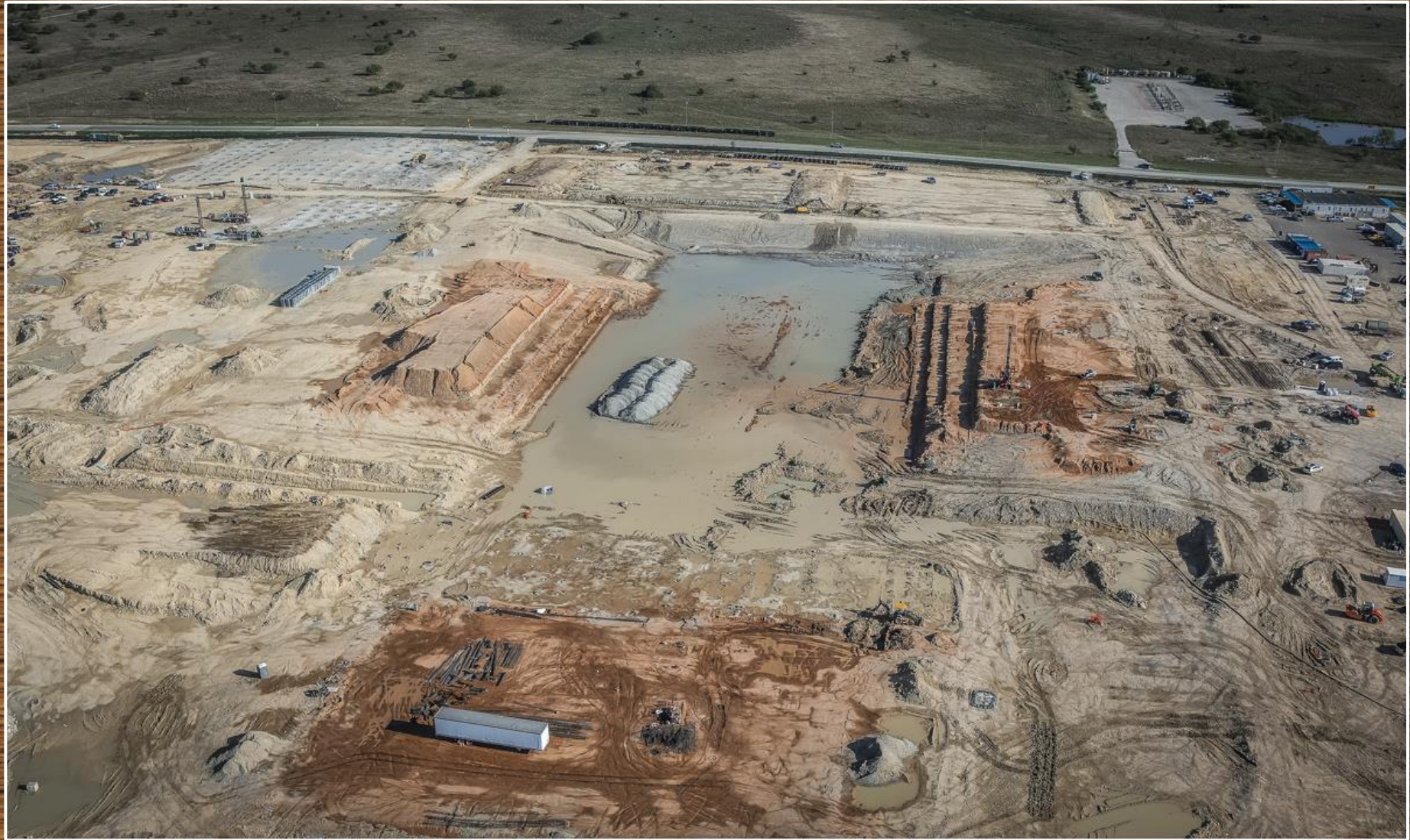
Work continues on the stadium.